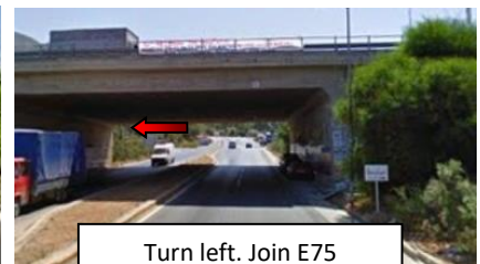
Turn left. Join E75

Follow road for 5.3 km to traffic lights with Inka supermarket on the right. Turn Right and then turn left after 300m following signs to Rethymno E75 and join the National Road. Stay on the E75 for 12.5 km, ignoring the first left turn to Kalyves/Gavalochori . Take the next exit signposted Kalyves/Armenoi. Keep left on the exit slip road and turn left at the junction.