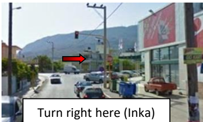
Turn right here (Inka)