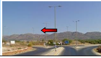
Keep left 1km from airport