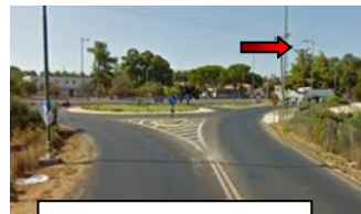
1 st exit at 1 st r'bout