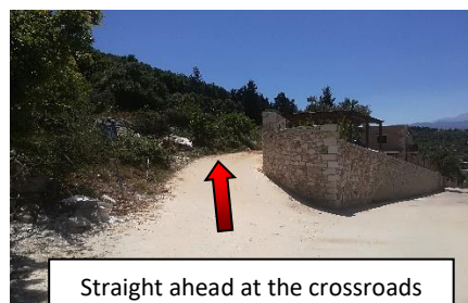
Straight ahead at the crossroads