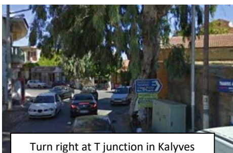
Turn right at T junction in Kalyves