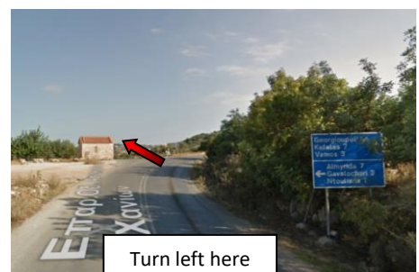
Turn left here

Follow this road for 1 km to a T junction in the centre of Kalyves and turn right. Follow this road uphill and round 2 hairpin bends and onwards through the village of Tsivaras. After 4.6 km look for a left turn to Gavalochori. Follow this road for 3.2 km until you reach the square in the centre of Gavalochori.