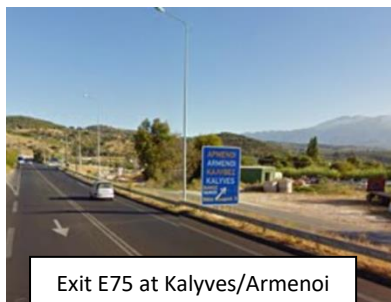
Exit E75 at Kalyves/Armenoi

Follow road for 5.3 km to traffic lights with Inka supermarket on the right. Turn Right and then turn left after 300m following signs to Rethymno E75 and join the National Road. Stay on the E75 for 12.5 km, ignoring the first left turn to Kalyves/Gavalochori . Take the next exit signposted Kalyves/Armenoi. Keep left on the exit slip road and turn left at the junction.