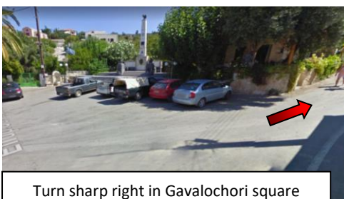
Turn sharp right in Gavalochori square

Follow this road for 1 km to a T junction in the centre of Kalyves and turn right. Follow this road uphill and round 2 hairpin bends and onwards through the village of Tsivaras. After 4.6 km look for a left turn to Gavalochori. Follow this road for 3.2 km until you reach the square in the centre of Gavalochori.