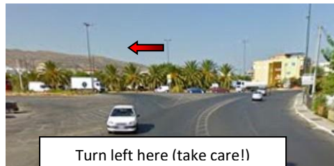
Turn left here (take care!)