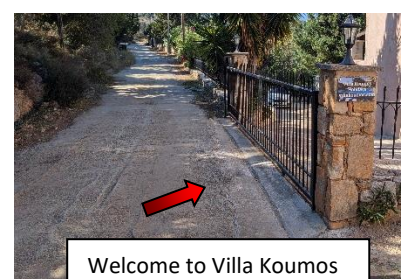
Welcome to Villa Koumos

Turn sharp right when you see the war memorial ahead and take the narrow uphill lane between 2 tavernas. Go straight over the crossroads at the top of the hill and after 150 metres look for the Villa Koumos gate post sign on the right. Slide the gate to the left and enter the driveway. The key safe is on the wall to the left of the courtyard gate and the code is 8268. The 3 Keys are for the courtyard gate, front door and safe in the master bedroom.