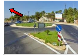
2 nd exit at 2 nd r'bout