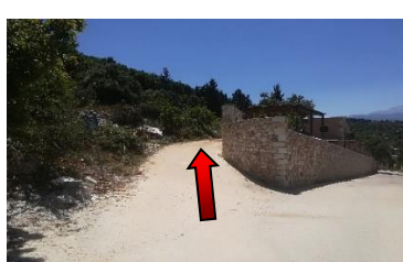
Straight ahead at the crossroads