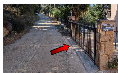
Welcome to Villa Koumos

Turn sharp right when you see the war memorial ahead and take the narrow uphill lane between 2 tavernas. Go straight over the crossroads at the top of the hill and after 150 metres look for the Villa Koumos gate post sign on the right. Slide the gate to the left and enter the driveway. The key safe is on the wall to the left of the courtyard gate and the code is 8268. The 3 Keys are for the courtyard gate, front door and safe in the master bedroom.