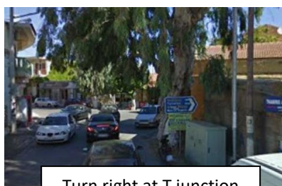
Turn right at T junction