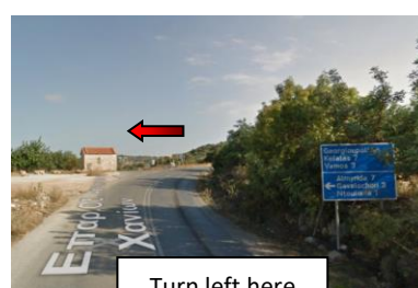
Turn left here

Follow this road for 1 km to a T junction in the centre of Kalyves and turn right. Follow this road uphill and round 2 hairpin bends and onwards through the village of Tsivaras. After 4.6 km look for a left turn to Gavalochori. Follow this road for 3.2 km until you reach the square in the centre of Gavalochori.