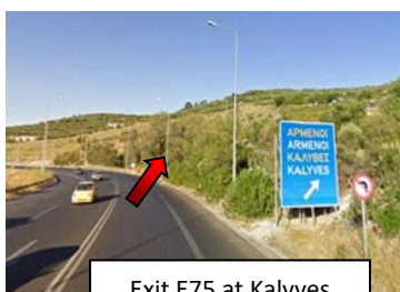
Exit E75 at Kalyves

Leave the airport and follow signs to the National Road/BOAK/E75 and take the direction Heraklion (Irakleio). Stay on the E75 towards Chania for 129 kms. Take the exit to Kalyves/Armenoi and turn right at the end of the slip road.